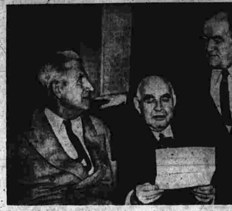
Three northern senators who have spoken out against a segregation "manifesto" signed by 100 southern members of Congress met in Washington, March 13. From left are Paul Douglas (D-Ill.), Herbert Lehman (D-NY) and Hubert Humphrey (D-Minn.).

...and an opened door knocked him to the ground when the car rolled backward. He was pinned under a wheel. A woman passing by picked up the car enough for him to squirm free. He rested a few minutes, then proceeded on his route.